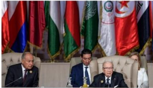
Tunisian President Beji Caïd Essebsi chairs a session of the 30th Arab League summit in Tunis