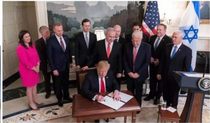
U.S. President Donald Trump recognizes Israel's sovereignty of the Golan Heights in the presence of Prime Minister Benjamin Netanyahu