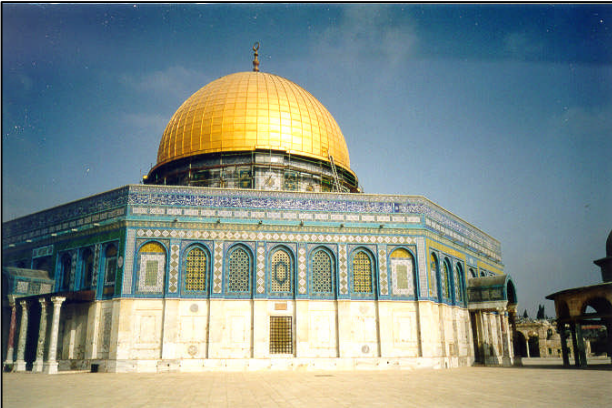
The Dome of the Rock, Location of the Jewish Temple

Allah hath purchased of the Believers their persons and their goods; for their (in return) is the Garden (of Paradise): they fight in His Cause, and slay and are slain: a promise binding on Him in Truth, through the Law, the Gospel, and the quran QurYan: and who is more faithful to his Covenant than Allah? Then rejoice in the bargain which ye have concluded: that is the achievement supreme.